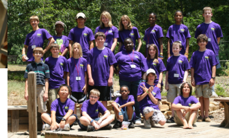
Students enjoying Y.E.S. camps.